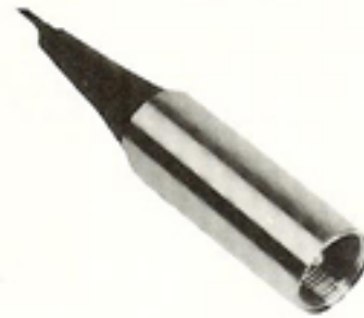
UHF - Waterproof